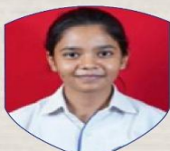
TANIYA BHATI (PAINTING)