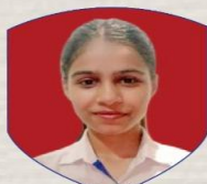
ALICE NAGAR (PAINTING)