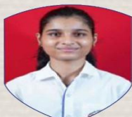
SALONI BAISOYA (PAINTING)